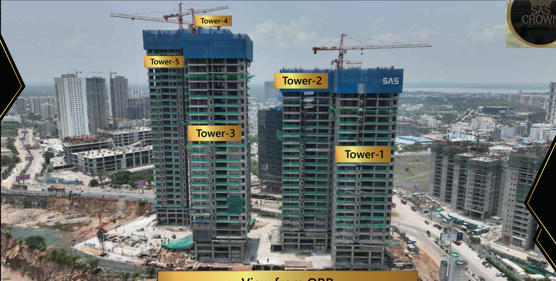
View from ORR