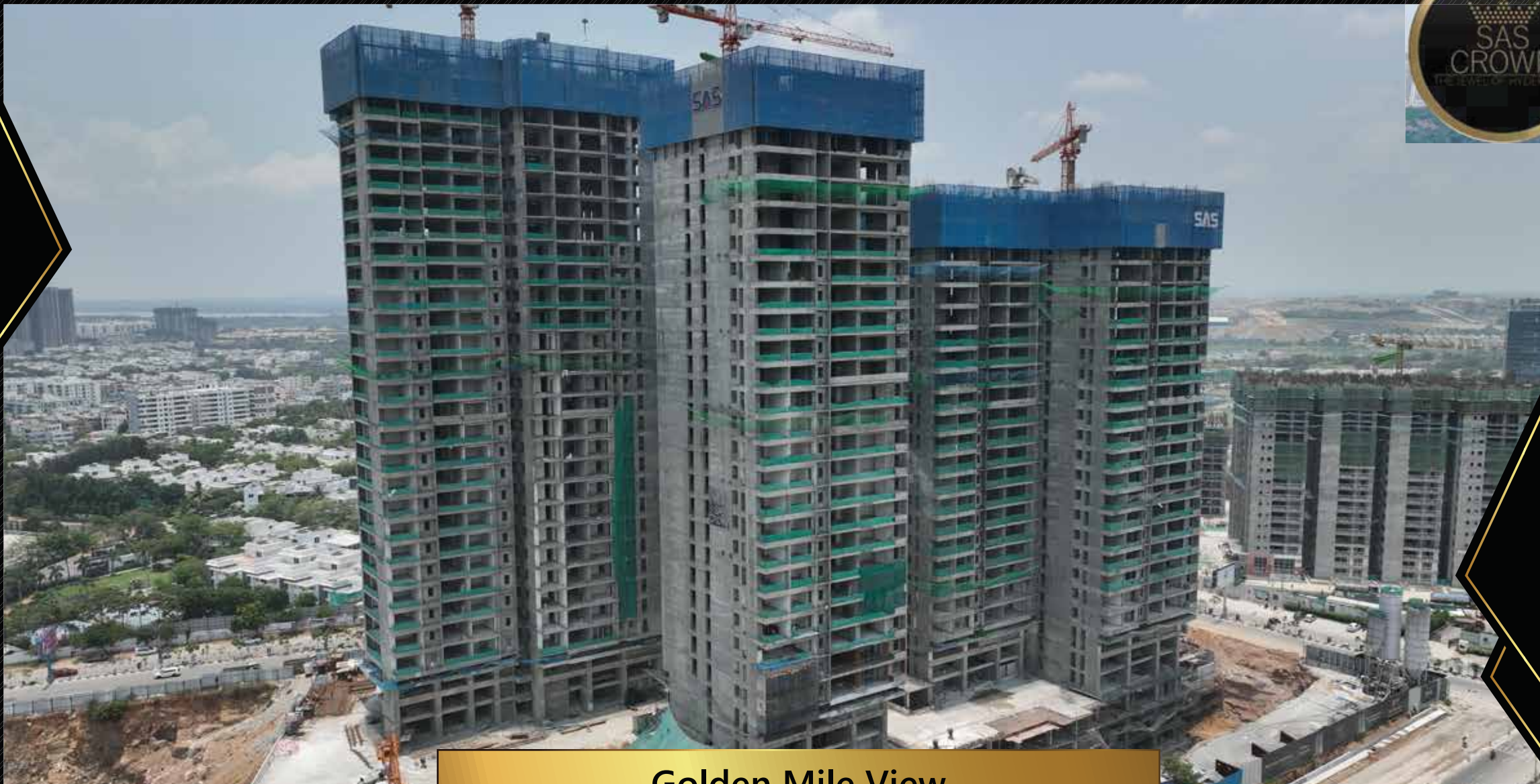
Golden Mile View