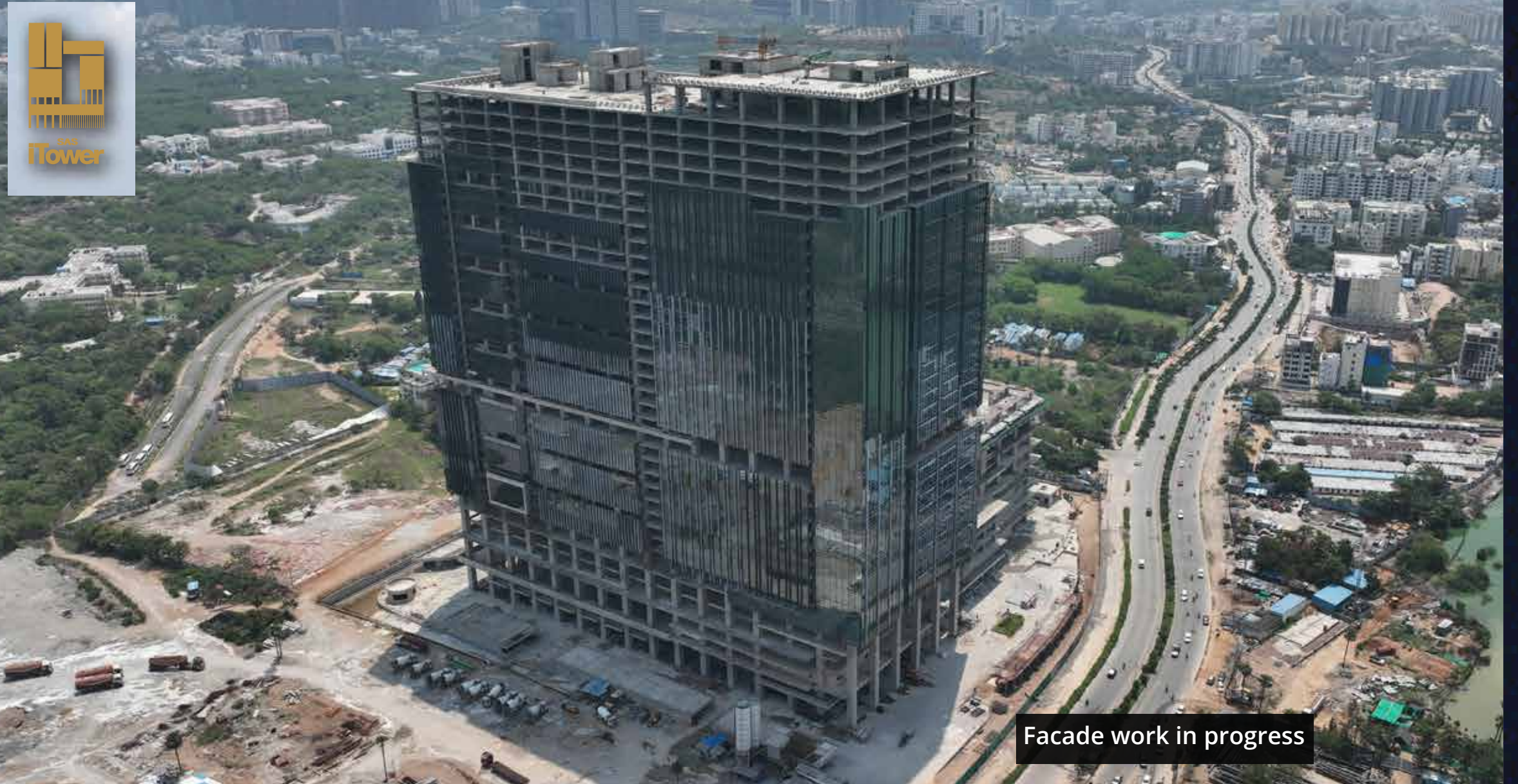
Facade work in progress