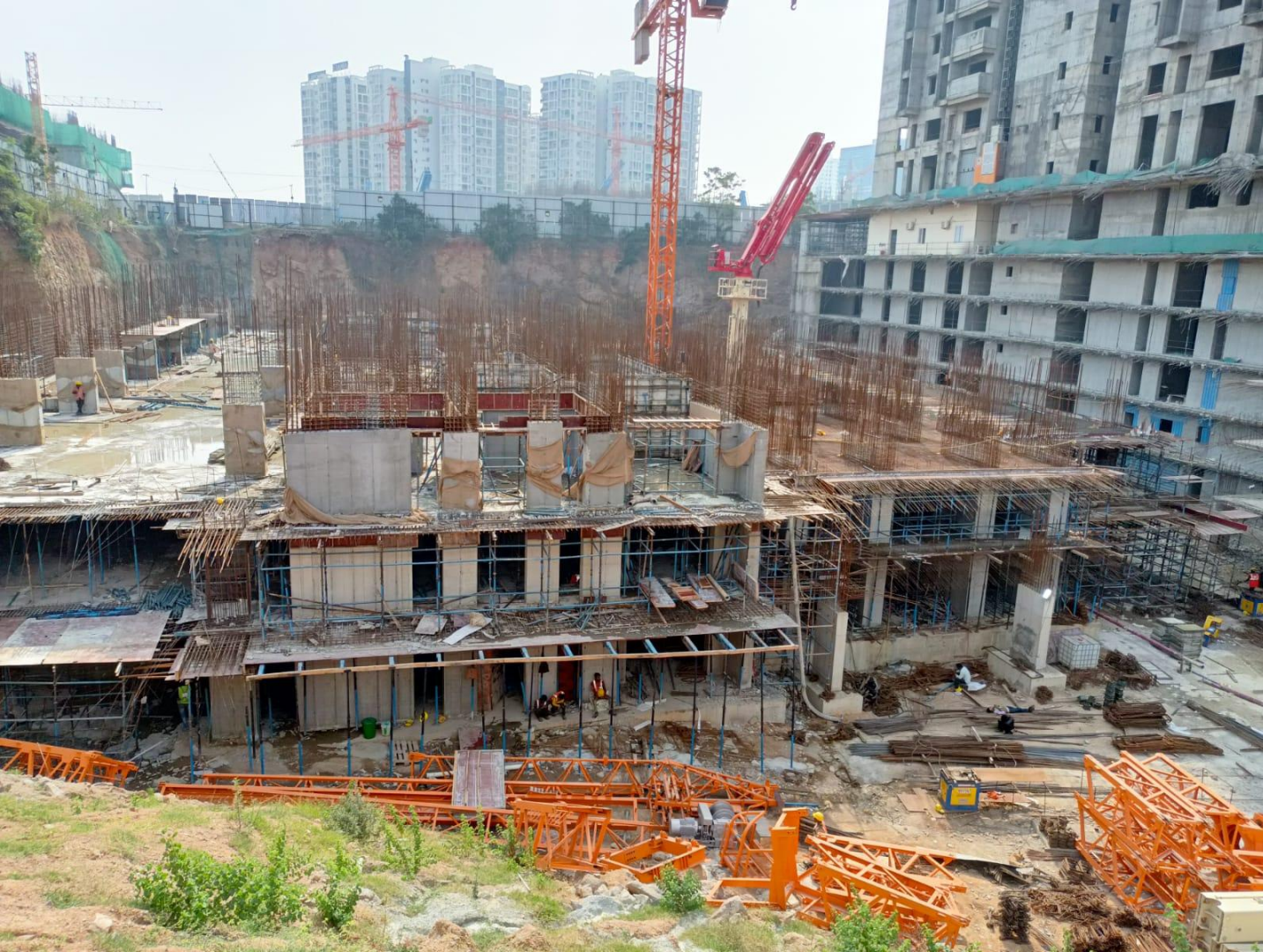
Tower - B